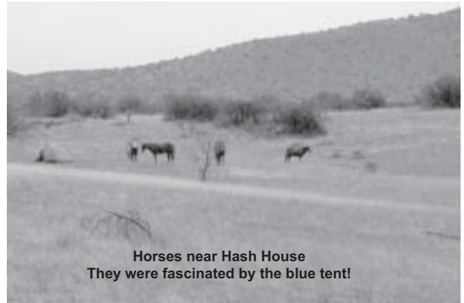
Horses near Hash House They were fascinated by the blue tent!