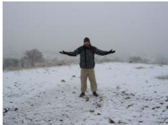
Sunny Arizona! March 19, 2006