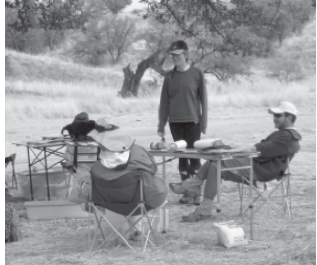
Resting between Sprint 1 and Sprint 2 on Sunday.