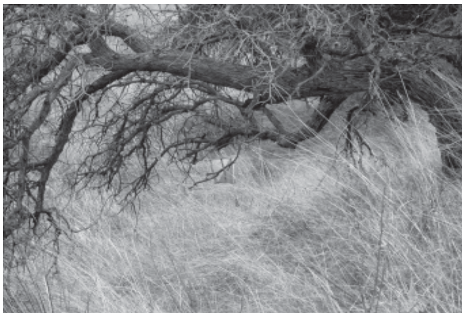
That lo-o-o-vely tall grass that made going cross country so much fun!